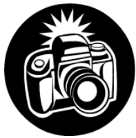
Photo Make-Ups - We will have a picture re-take day on Tuesday, September 19 th for any students who were absent on September 14 th . There will be one more picture retake day scheduled after photos arrive in the event that you are not 100% satisfied with your child's photograph.

Shopping at Hannaford's helps our school earn money~ Buy any of over 1,500 qualifying products and for every four purchased, get 3 school dollars. Deposit your school dollars in the collection tower (in Brunswick) and done. See flyer for list and start shopping! (Dollars can also be sent into West Bath School)